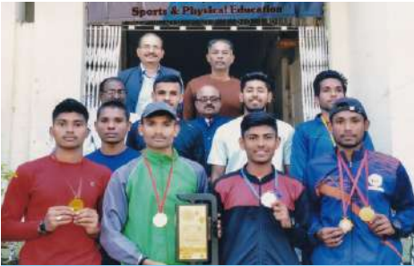
Athletics - First Place