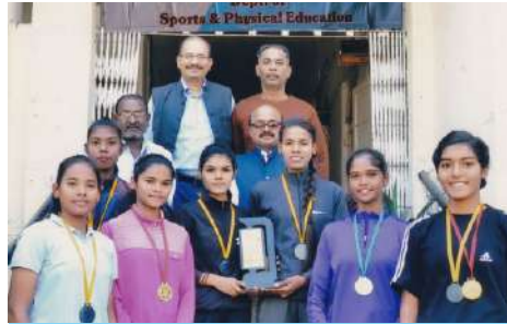
Inter Collegiate Athletics (Women) - 3rd Place