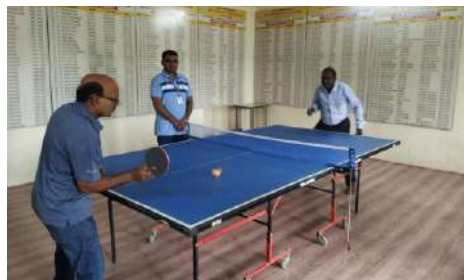
Inter Staff Tournament - Table Tennis Final Match