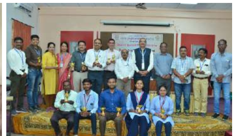
Inter Staff & Inter Class Tournament Prize winner