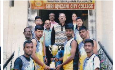
Kho-Kho (Men) Championship