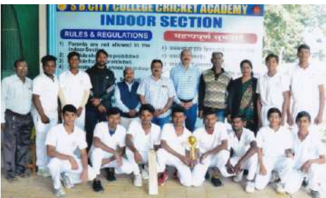
Jr. Under - 19 Cricket Runner-Up